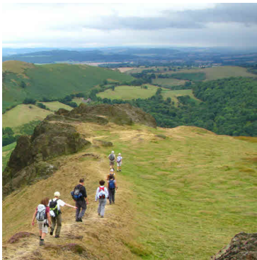
of some of the medium walkers descending Caer Caradoc led by Lynda Shaw.