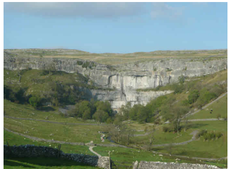
of members on Malham Cove foot-bridge and of Malham Cove itself.