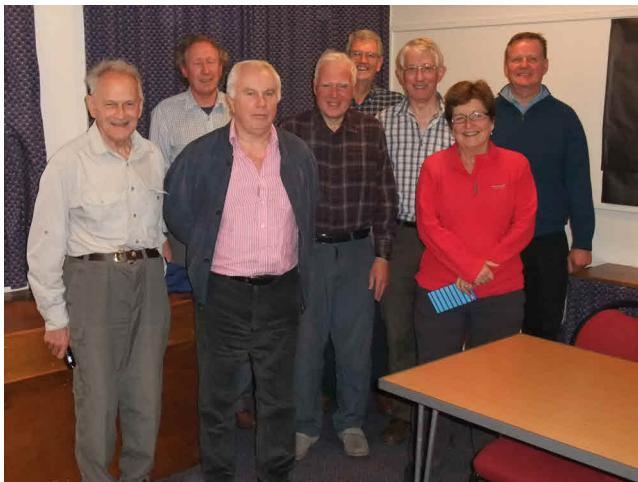
The new committee

The meeting was well attended and the members generously supported the thanks given to the many members